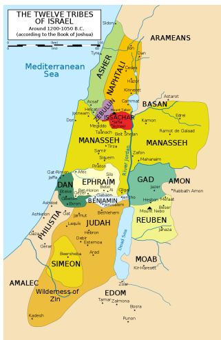
Zebulun & Issachar - Click to Enlarge