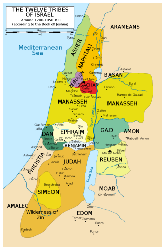
Benjamin - Click to Enlarge

Genesis 44:20 "We said to my lord, 'We have an old father and a little child of his old age. Now his brother is dead, so he alone is left of his mother, and his father loves him.'